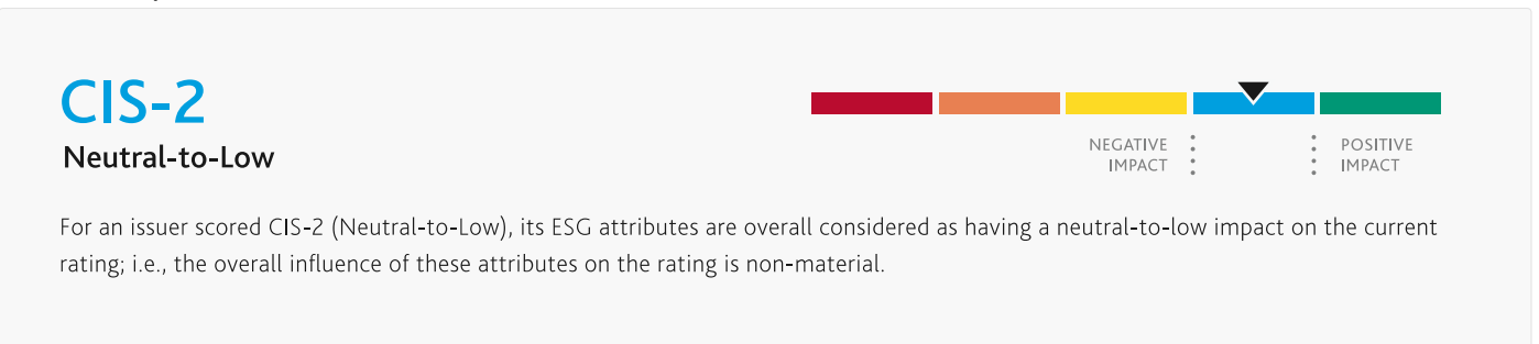
Exhibit 3 ESG Credit Impact Score